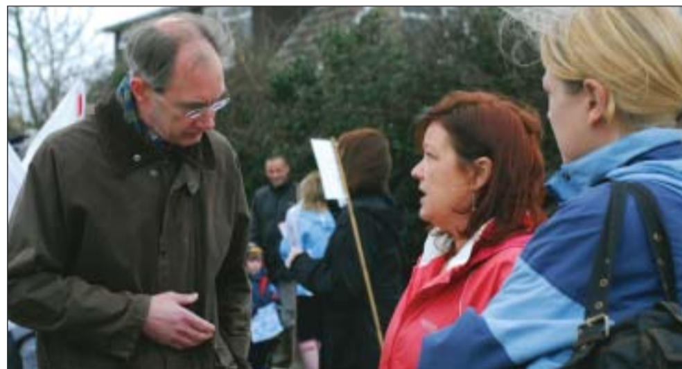
Protest march about closure of primary schools from Totland Recreation Ground to Stroud Green. Island MP Andrew Turner talking to concerned parents.

You can read Andrew's submission in full and comment online at www.islandmp.org .