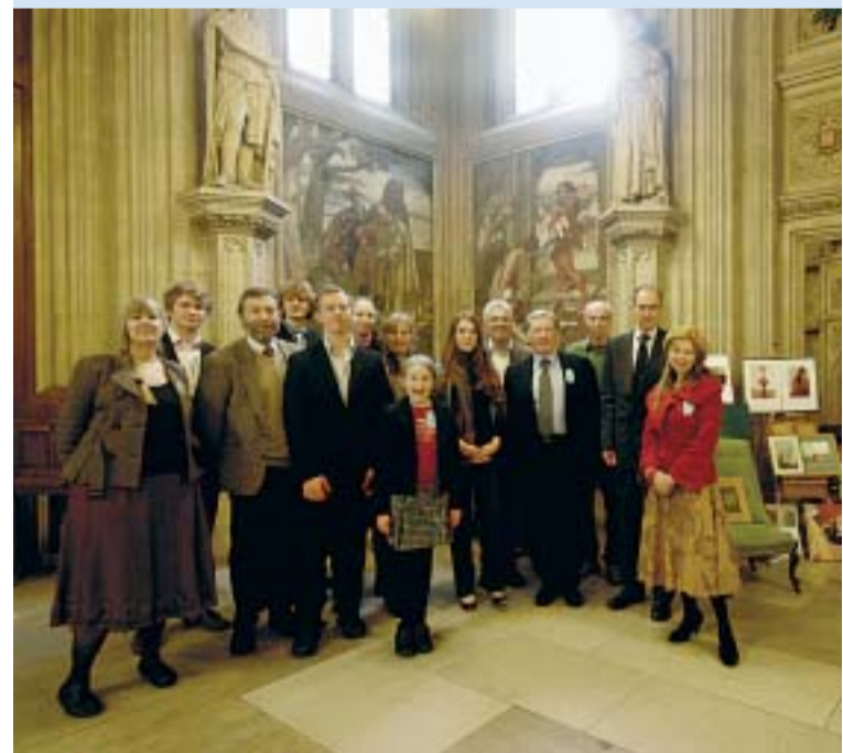
Some of the families who came to see their work in the Upper Waiting Hall in the House of Commons on 4th December 2007. They all took part of the 'Inside Out' exhibition of work by five Island families who live with autism.